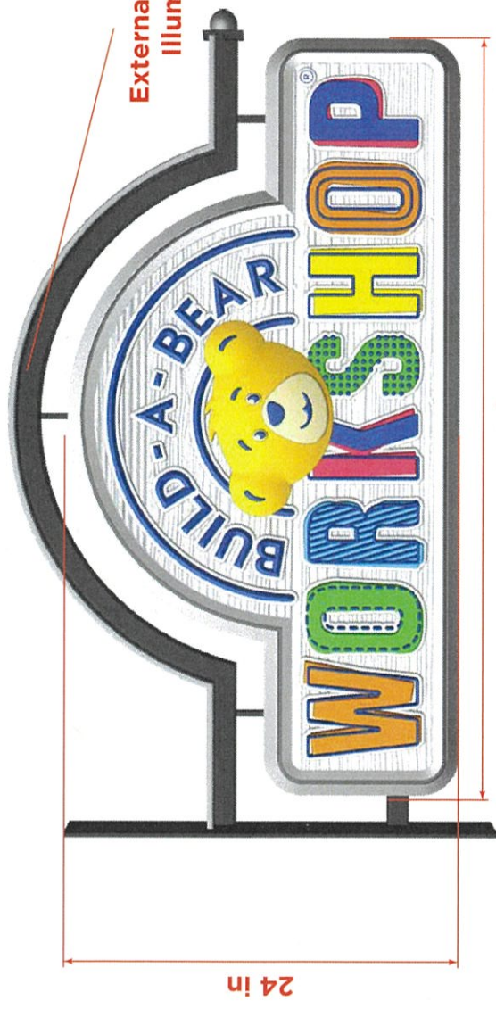
Externally Downward Facing Illuminated Light-Bar